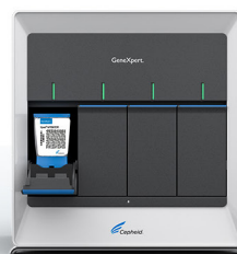
GeneXpert System (R2 model) with 10-Color Technology