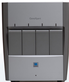
GeneXpert System (R1 model)